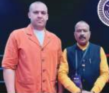
Mr. Umar Kremlev President IBA