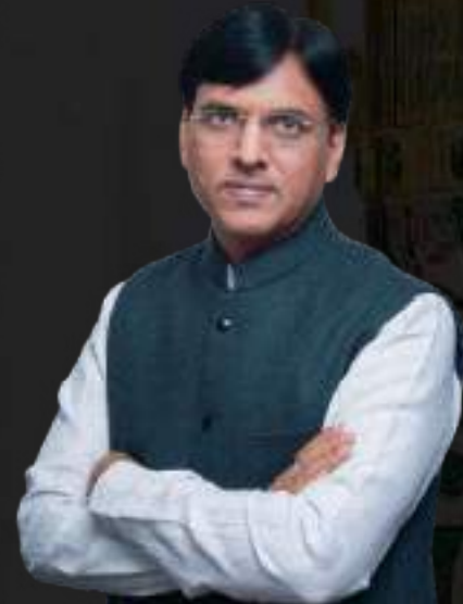
DR. MANSUKH MANDAVIYA

HONORABLE UNION MINISTER OF SPORTS & YOUTH AFFAIRS, INDIA