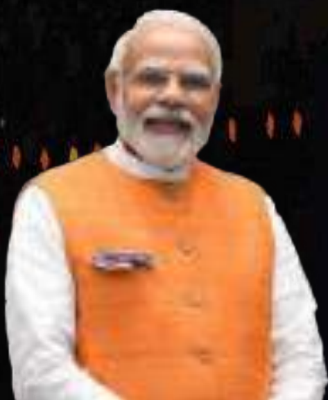
SHRI. NARENDRA MODI